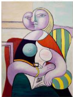
Pablo Picasso: Reading Woman 1932 © RMN - Grand Palais (Musée national Picasso-Paris)/Renzi-Cabriel Ojeda © 2016 - Succession Pablo Picasso - MENEGART